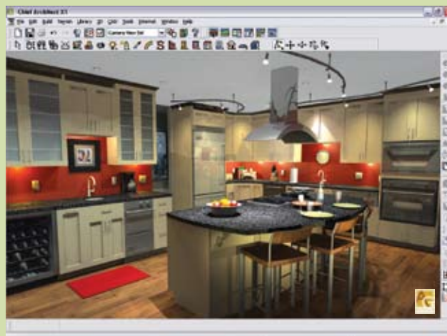
Visualize with Kitchen & Bath Tools