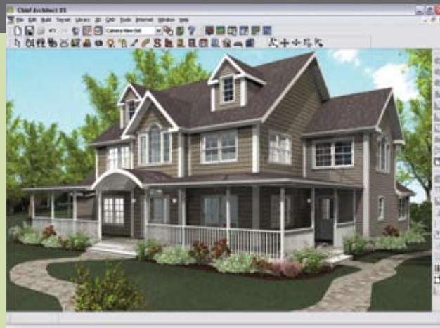
3D Renderings to Help Sell Your Projects

With Chief Architect, your sales staff, designers, and builders can close business faster. Use the powerful 3D visualization tools to help clients see the project or design changes before construction begins. If your customer wants changes to the kitchen, bath, or master bedroom, quickly show them in a 3D rendering to meet their exact needs in minutes. Creating a 3D view is easy – simply point and click the camera in Chief Architect for an automatic 3D model – which you can quickly make changes to including doors, windows, cabinets, and more. A professional and realistic 3D view can make the difference between your company and your competitor building the next new home. Sell your clients with 3D views and close more business using Chief Architect in your sales process today!