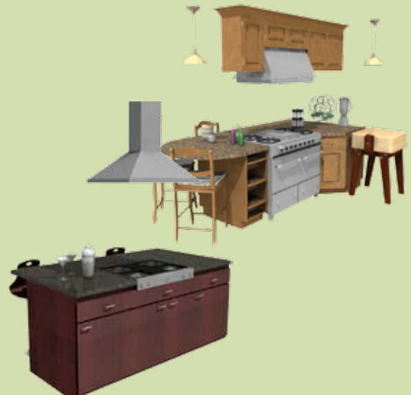
Choose from over 10,000 Library Items

Chief Architect, Inc. • 6500 N. Mineral Drive, Coeur d'Alene, ID 83815 Phone 800.482.4433 • 208.664.4204 • Fax 208.664.1316 www.chiefarchitect.com • sales@chiefarchitect.com