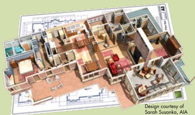
Automatic 3D Renders & Virtual Tours